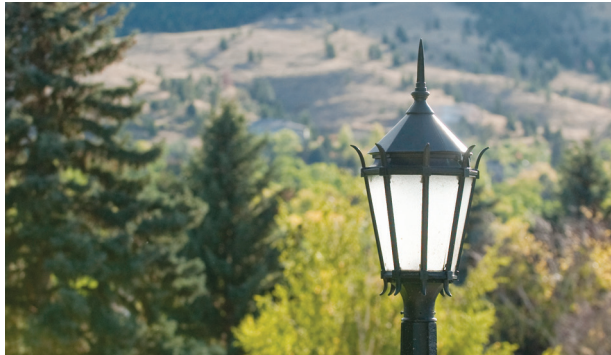
Carroll College Faculty Accomplishments 2013