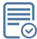
Identity Theft Affidavit